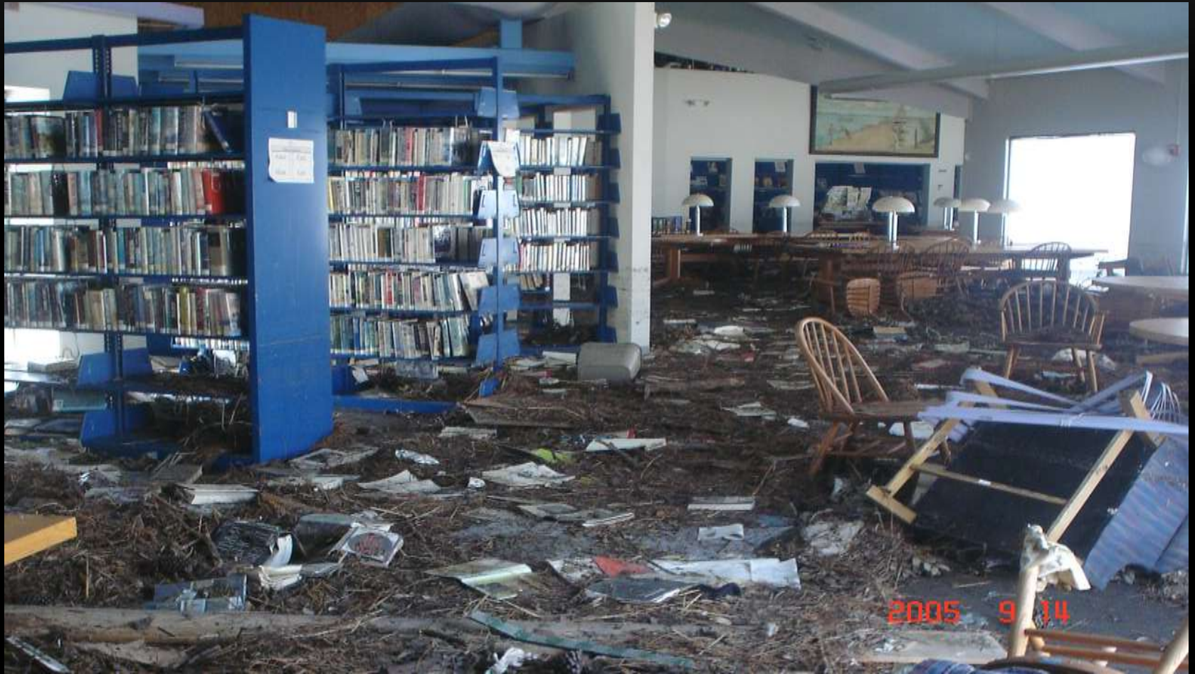
Biloxi Public Library, MS